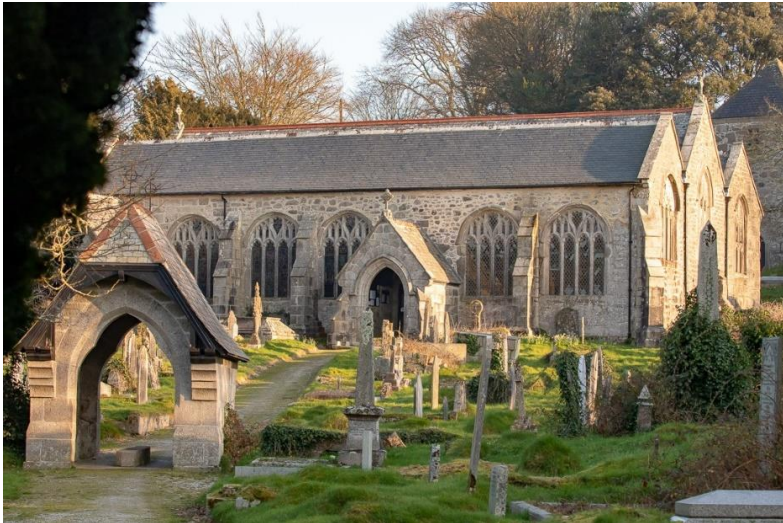
St Wenappa, Gwennap

Church: Perranporth Methodist Church Denomination: Methodist Date of Grant: 23 March 2018 Grant CHCT: £1,300 Work: Removing cement mortar strap pointing from roadside face of church building and replacing with flush lime mortar