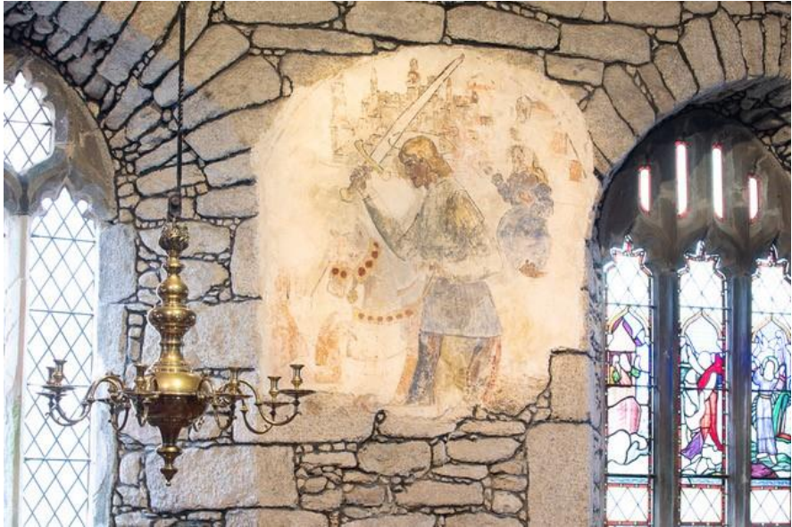
Wall painting, St Just in Penwith

Total: £13,500 Work: Urgent work to cure dampness in spire by removing cement-based mortar and re-pointing with lime. Address spire structural weakness resulting from bell frame main supports corroding.