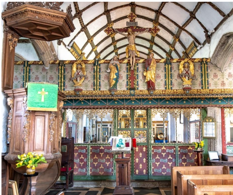
Blisland church interior

Church: Zion Community Church Denomination: Independent Date of Grant: 23 March 2018 Grant CHCT: £2,100 Work: Improvements to the fire safety of the building, improvements to the exterior of the building and updating of facilities to make them more family and disabled friendly.