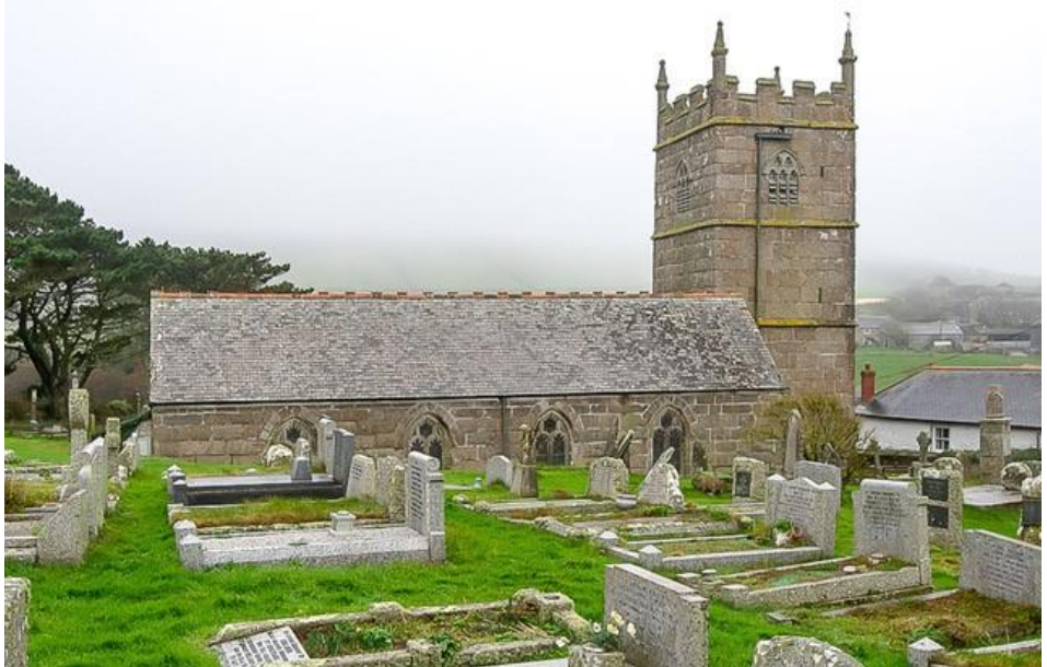
St Senara church, Zennor

Work: Replacement of lead roof to tower, repairs to parapet, renewal of door to the access tower, replacement of rainwater goods on tower.