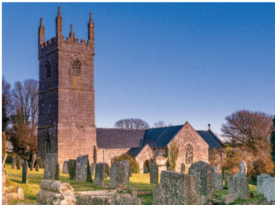
St Mawgan in Meneage

Church: St Iva, St Ives Denomination: Church of England Date of Grant: 20th Jan 2022 Grant: £2,000 Work: Repairs to clock ( see photo back cover )