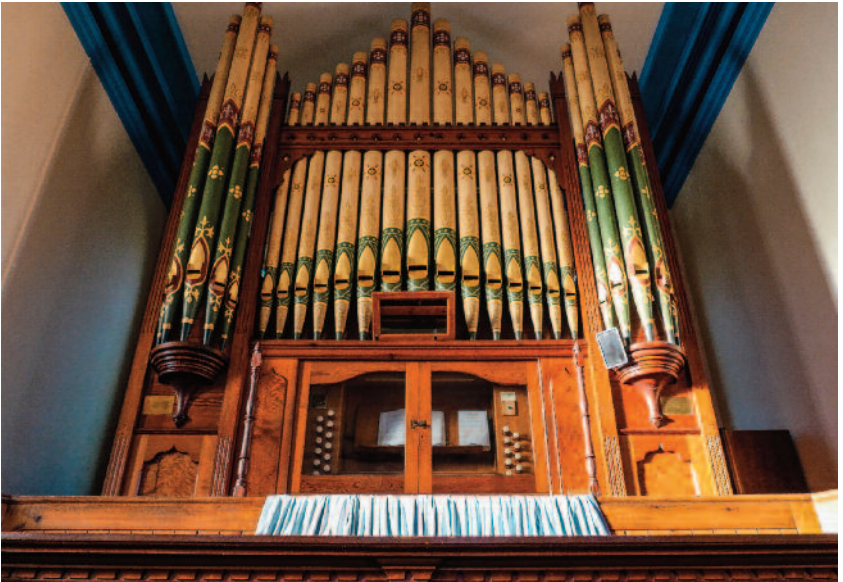
Marazion Methodist church

Church: St Mawes Denomination: Church of England Date of Grant: 3rd March 2022 Grant: £5,000 Work: Repairs to west wall, installation of vertical slate hanging, repairs to south face and bell turret, slates and gutters.