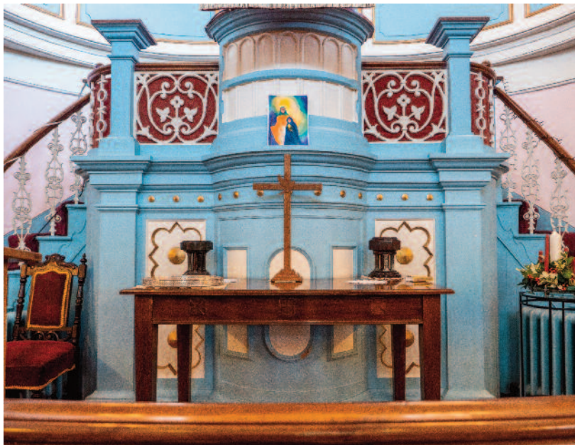
Leedstown Methodist Church

Church: Truro Cathedral Denomination: Church of England Date of Grant: 25th May 2022 Grant: £5,000 Work: Further grant for repairs to roof, stonework and rainwater goods of St Mary's Aisle